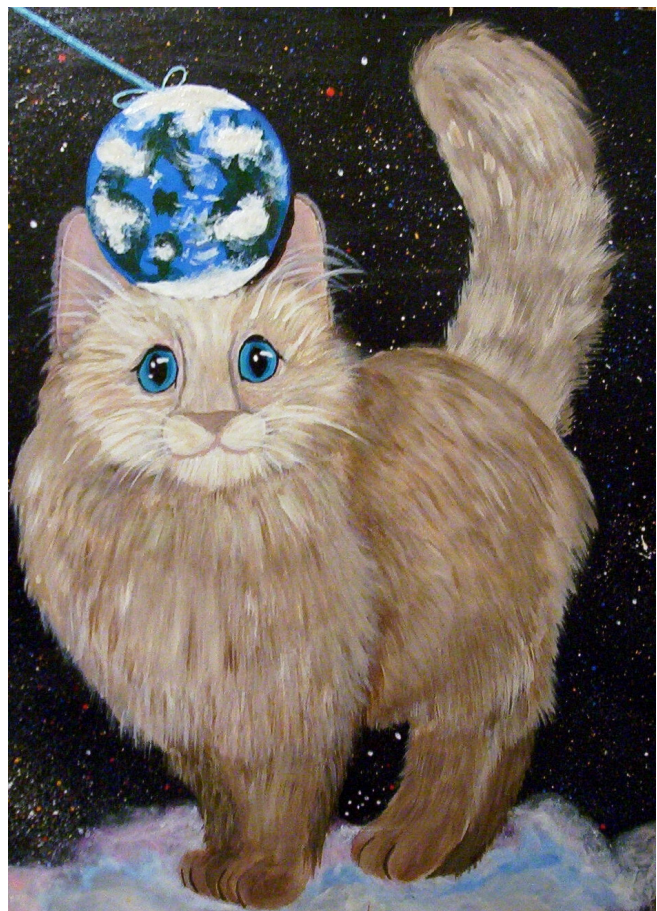
Copyright © 2006 by Kheinsa, Reproduced with permission

Copyright © 2004 Michael Moore Reprinted with permission from 'Living Thought' Published by Gold Century Press